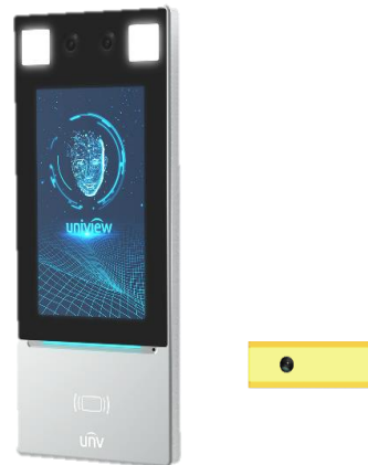
Basic Kit = wall mounted installation

*Attention: Floor-stand installation requires additional CT-EP-S31-W-NB bracket and stand